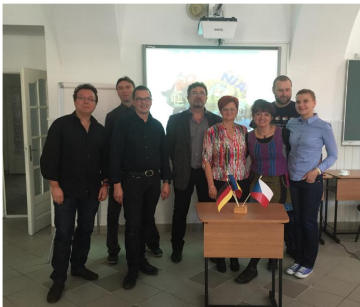
Partner Meeting in October 2015 in Timisoara, Romania.

Currently the consortium is working on the curricular design and the train-the-teacher module which should be implemented as a face-to-face as well as online course. At the end of October the consortium had its third, successful partner meeting in Timisoara, Romania. The focus was on the discussion of the ongoing tasks and next steps for implementation. The partners are proud for the integration of the first Micro Units with the contents around language learning, mathematics and sales. All information are available at our project website: http://seel.eduproject.eu/